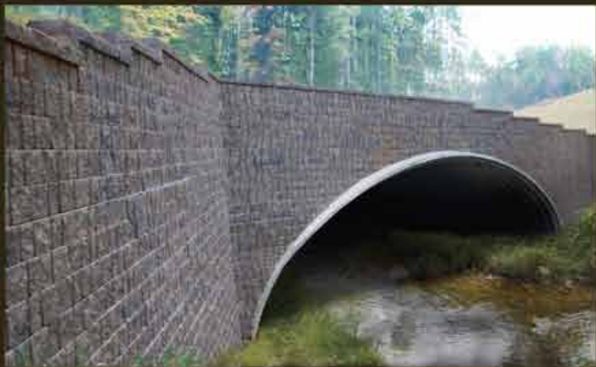
This project uses only Left Headers and Right Headers.

The color palettes are deep, rich and regal with shades of burgundy, navy, ocher and cream, muted for a timeworn effect.