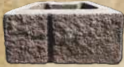
Belgado® Left Header

Belgado® features five unique pieces in four beautiful, carefully-crafted color variations and patterns.