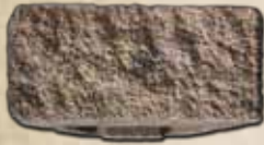
Belgado® Stretcher (optional)