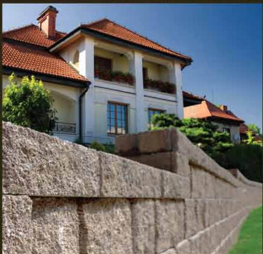
Design Versatility - this project uses Belgado® Stretchers and Headers.

Belgado® was developed by RidgeRock® to provide a beautiful and upscale appearance without sacrificing the structural integrity of the retaining wall project.