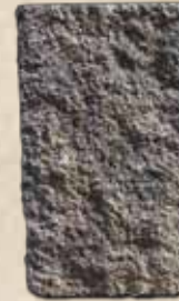
Belgado® Vertical Jumper (optional)