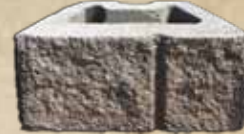
Belgado® Right Header